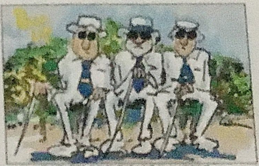
THE SELECTION COMMITTEE